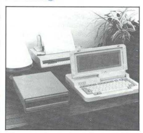
Desktop display of Standard C shipboard system.

Interested parties will gather at COMSAT this month to review the sea trial results.