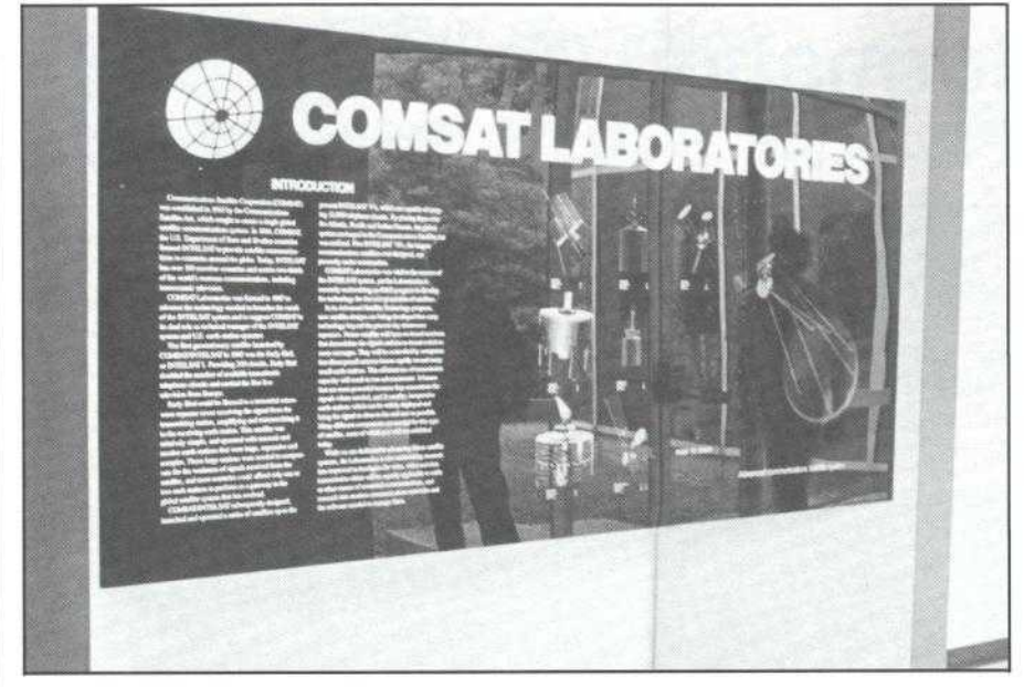
The first exhibit that visitors to the Labs will see.